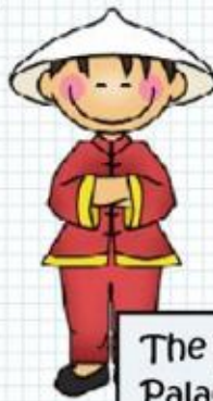
The Beijing Palace