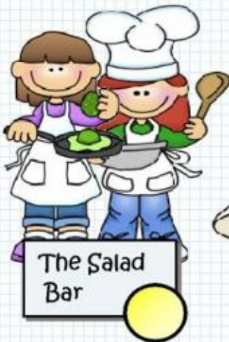
The Salad Bar