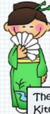
The Japanese Kitchen